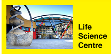
Life Science Centre