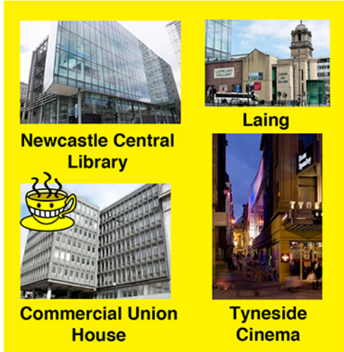
Newcastle Central Library